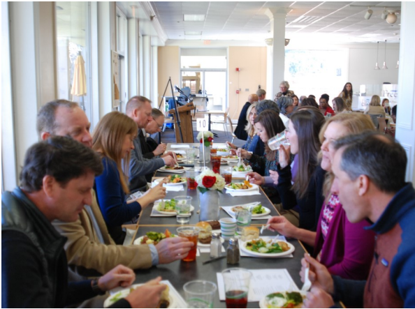
Free Clinic Supporters enjoying the 2019 Leading the Way Luncheon