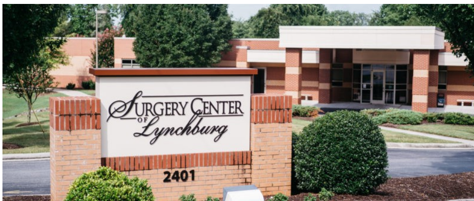
The Surgery Center of Lynchburg